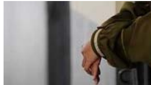
Remaja ditahan bawah Ordinan Darurat