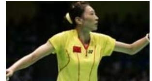
Badminton 'skirts controversy' heats up