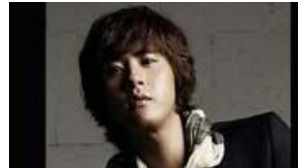
Second Korean celebrity suicide in a wee ...