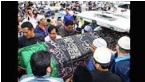
Keluarga Sarbani hendak tahu status kes